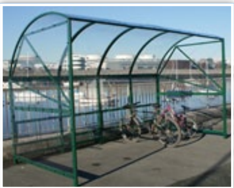
Curved cycle shelter