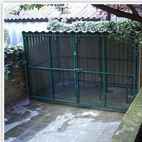
ReCycle 30 bike space