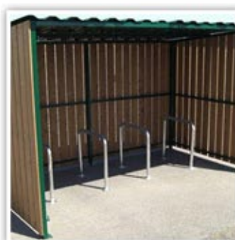
ReCycle 20 bike space