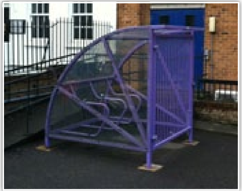
Mini BDS shelter