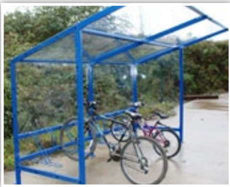
Lightweight bike shelter