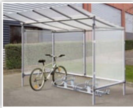
Economy bike shelter