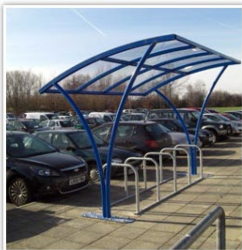
New York shelter