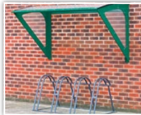
Junior shelter 4 or 8 bikes