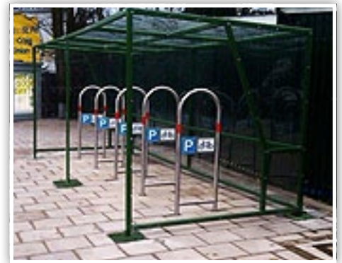
The square shelter