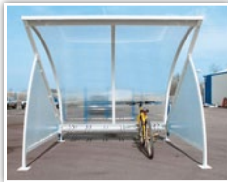
Moon shaped shelter