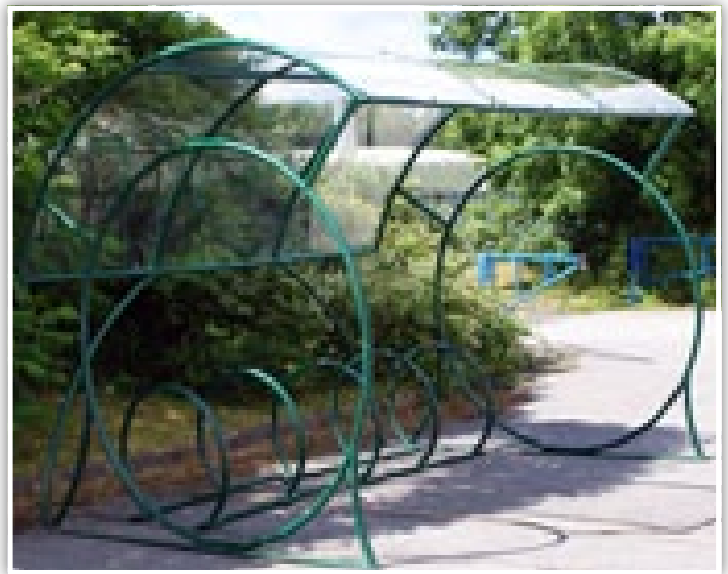
Curly bike shelter