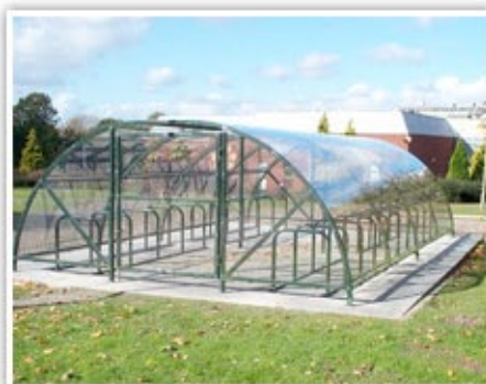
BDS 40 space shelter & toaster