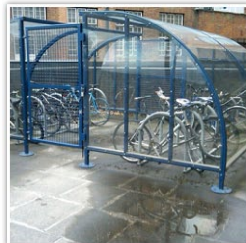
BDS 20 space enclosure & toaster