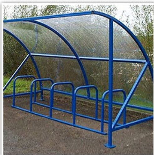
BDS 10 space shelter & toaster

Our extensive range of bike shelters are robust, contemporary and extremely practical. Whatever dimensions and style you're looking for we'll have the right cycle compound for you.