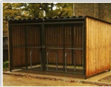
The ReCycle shelter