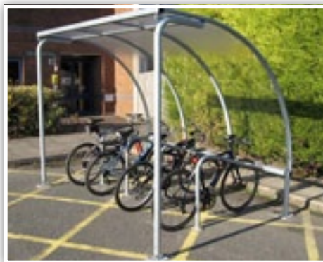
VS1 bike shelter