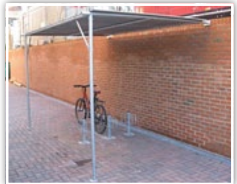
Value range bike shelter