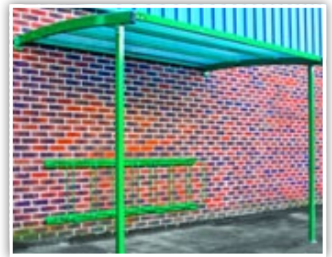
Wall mounted cycle shelter