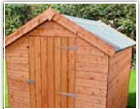
BDS 2010 compliant shed & underground Sheffield stand