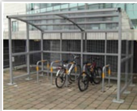
The prestige shelter